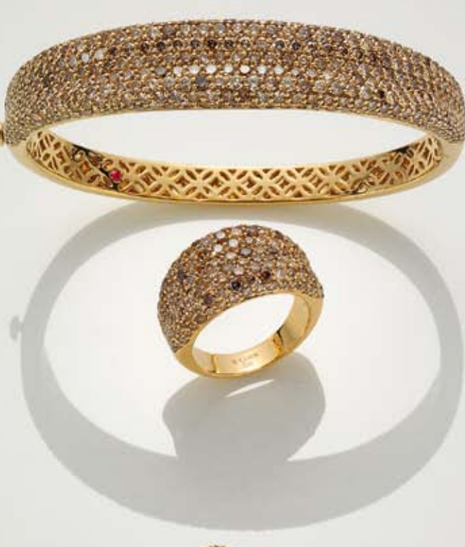
Fantasia Collection: bangle, ring and earrings in 18k yellow gold with cognac diamonds.