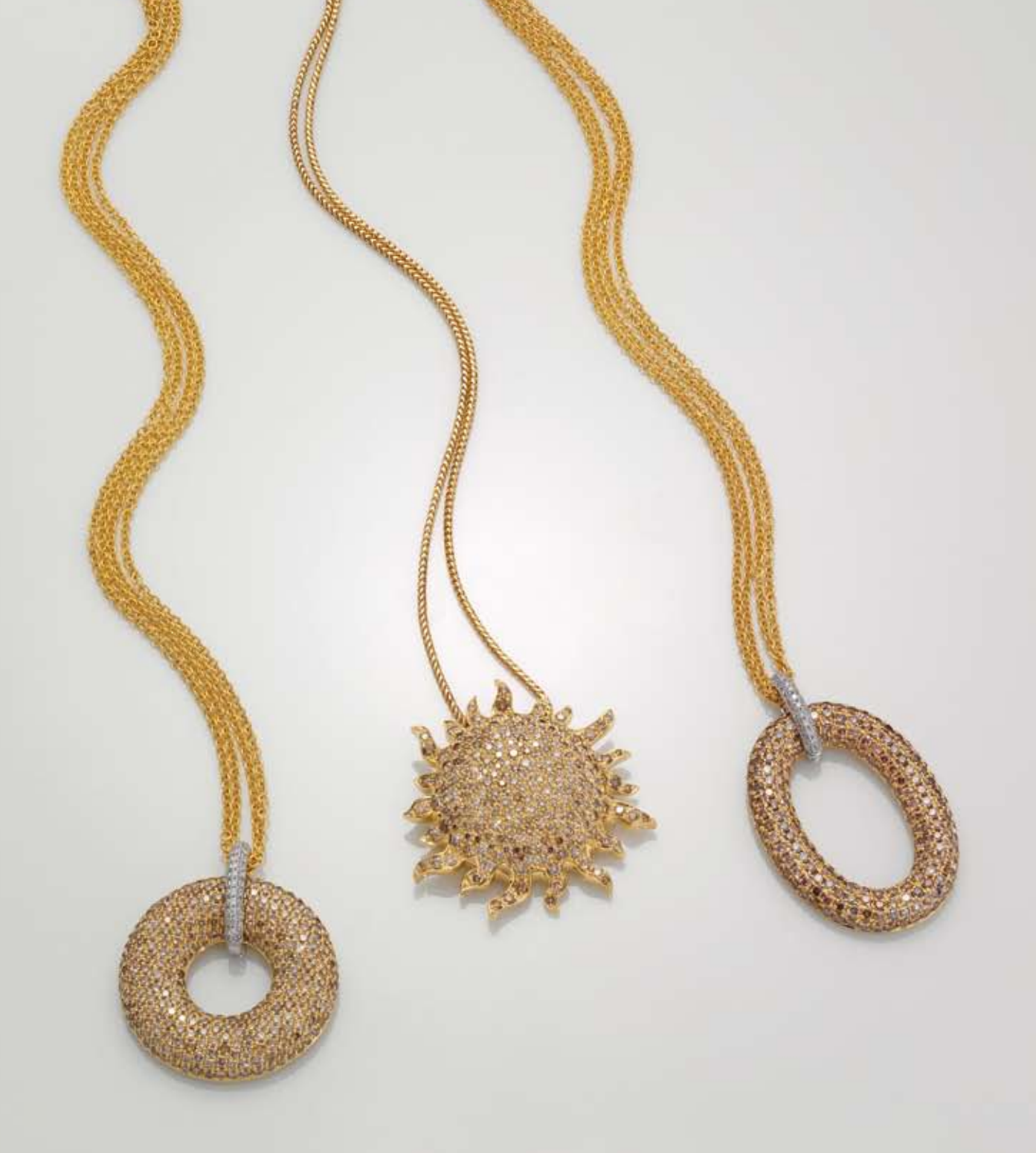
Fantasia Collection: pendants in 18k yellow and white gold with cognac and white diamonds.