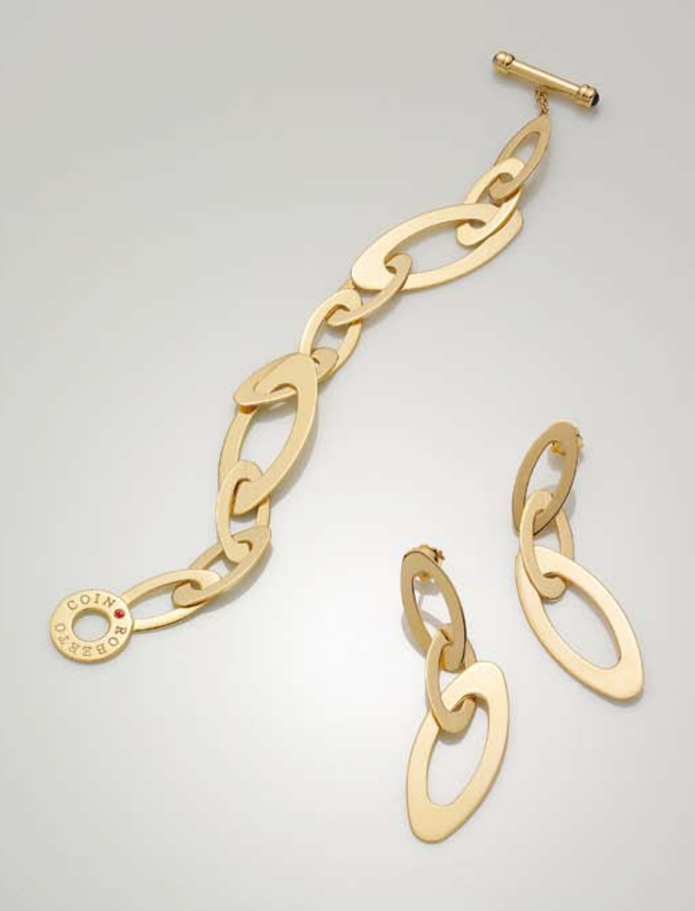
Chic and Shine Collection: 18k yellow gold oval link bracelet and earrings.