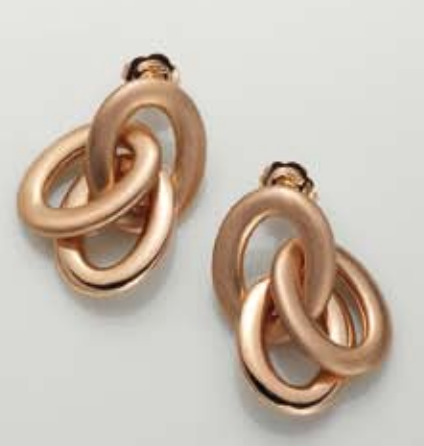
Bold Gold Collection: 18k rose gold link necklace and earrings.