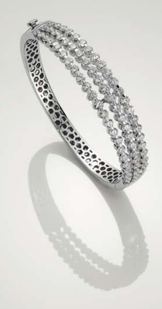
Classica Collection: 18k white gold and diamond three row bangle.