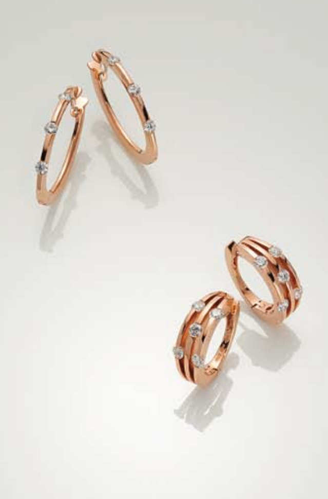
Classica Collection: earrings 18k rose gold and diamonds.