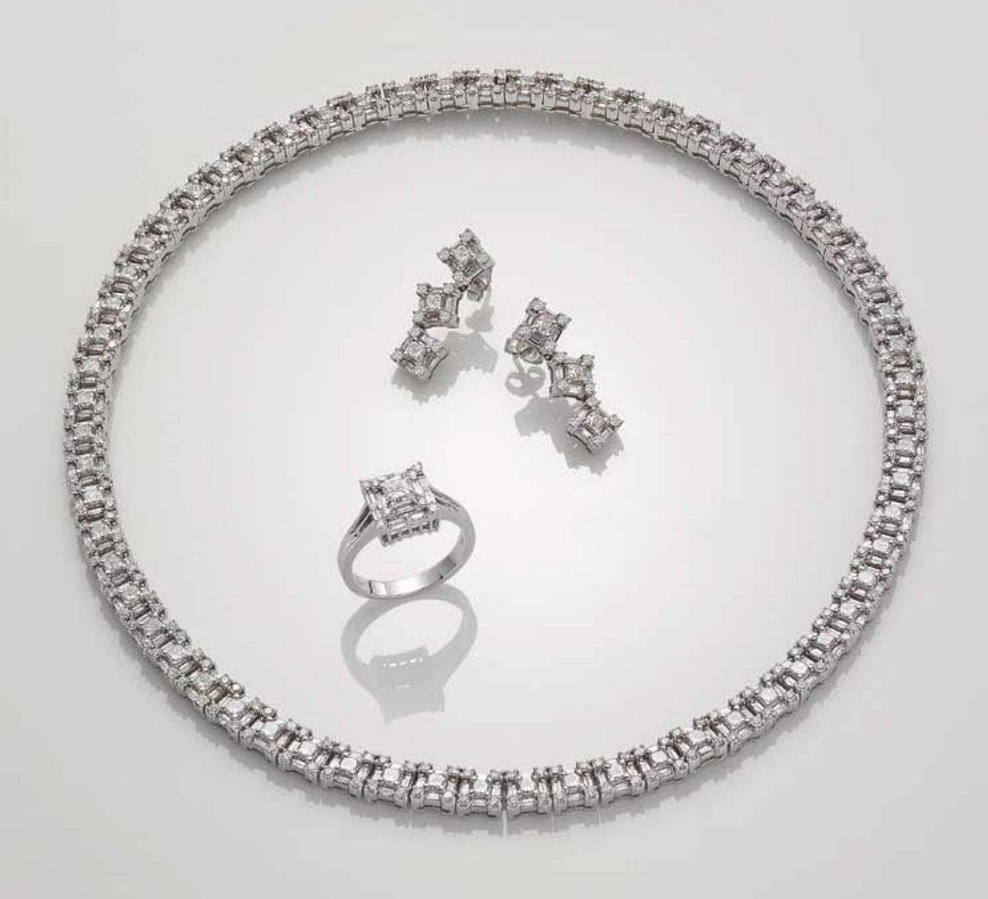
Diamond Collection: 18k white gold and diamond princess baguette necklace, earrings and ring.